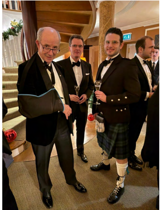
The evening began with crémant and a live jazz duo.