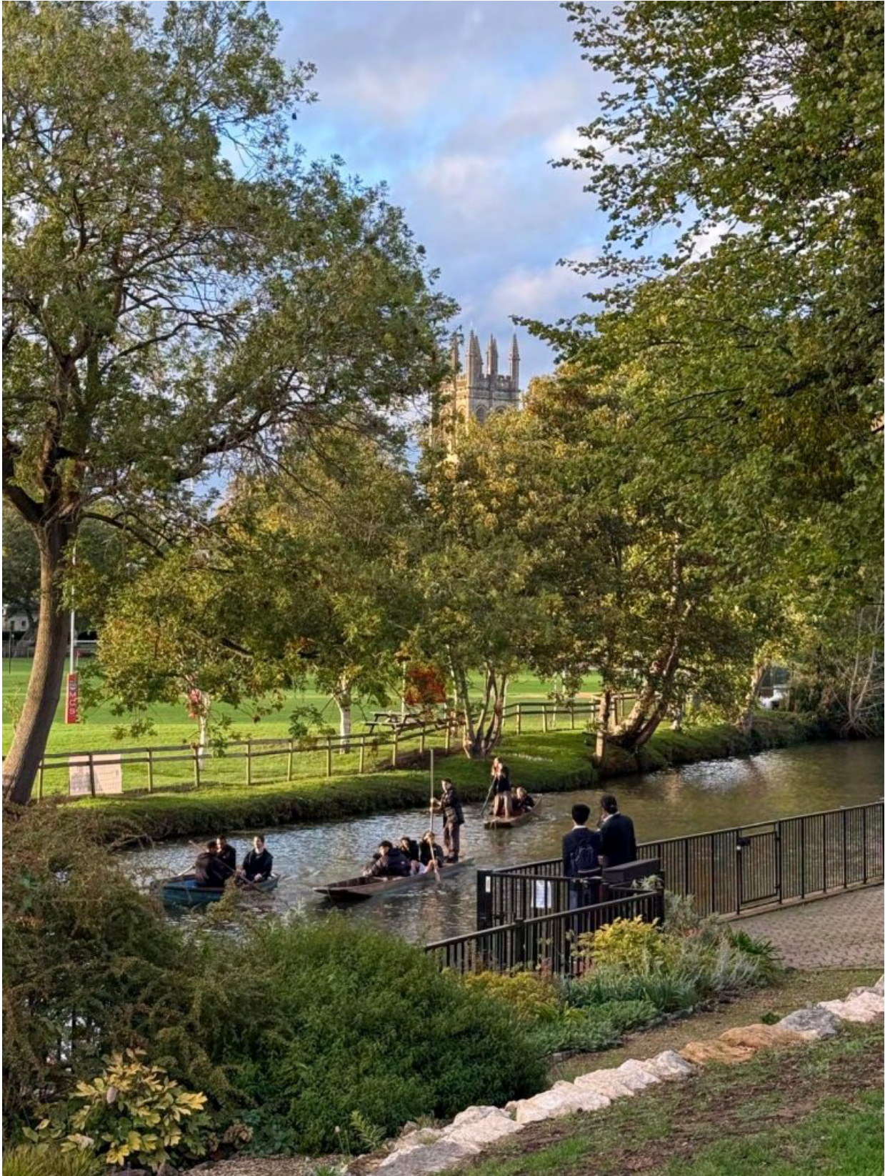
Oxford September 2025