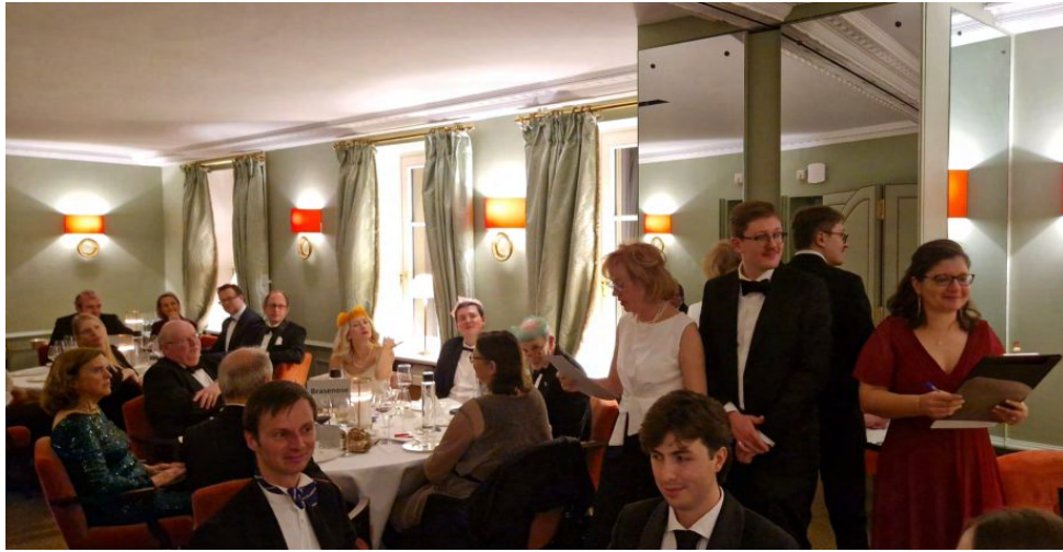
As something new, your Chair arranged a Christmas quiz and much fun was had.