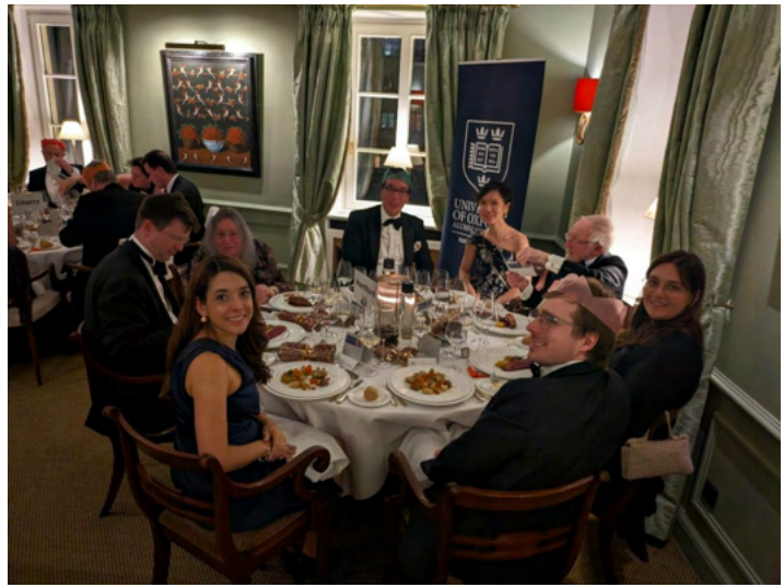
We enjoyed a delicious dinner where toast were said and carols sung.

14 December 2025: we rounded off the year with Oxford arranging our Oxbridge visit to the Christmas Fair. Hotel Cravat has become too expensive, so we met at Cafe SpoT and followed it up with Glühwein at the very busy Christmas Market!