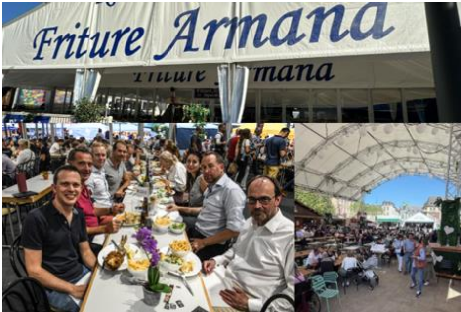
Last year's cheerful Oxbridge meal at Friture Armand

No August in Luxembourg without our Oxbridge dinner at Friture Armand amid the bustling Schueberfouer! As this is a Thursday it takes the place of our monthly Oxbridge drinks.