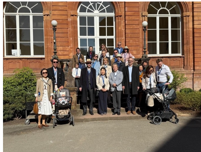
Our group in front the headquarters of the old Abbey