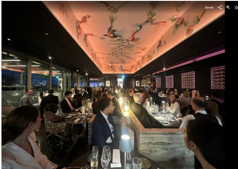
The Tripartite Dinner 2024, Skybar