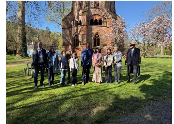
On the tour of the V&B park