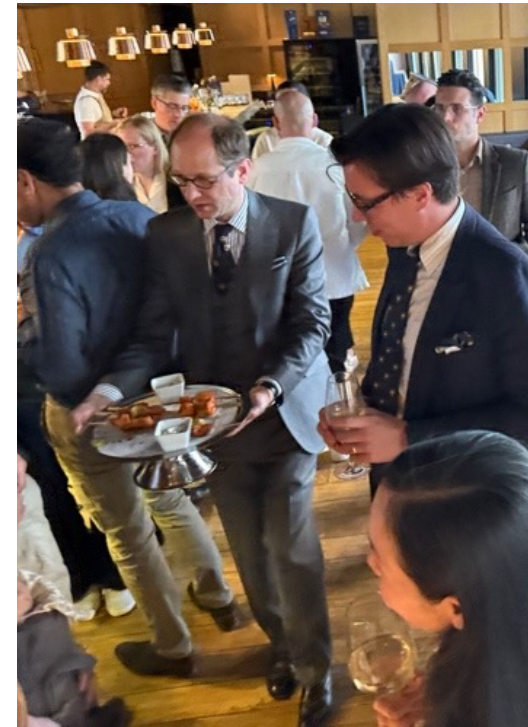
'Old' and new members mingle at Café des Capucins (now Mezza)