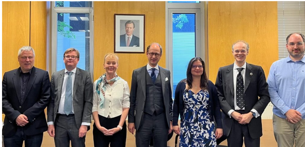
Members of the outgoing OUSL Committee at the AGM, 17 June 2024